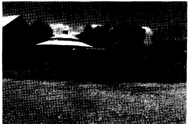
The Wood Annex Summer 2008